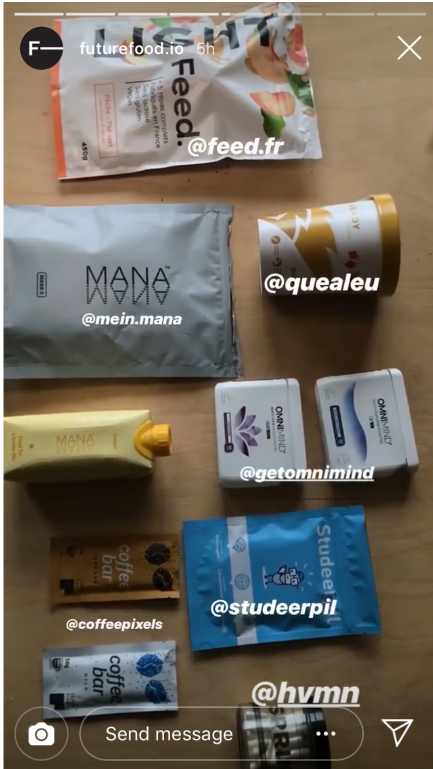
Figure 8: 21