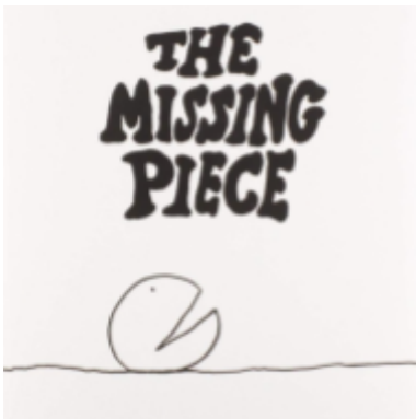
Silverstein, S., 1976. The Missing Piece . Harper & Row.

The Giving tree is about a Tree and his favourite boy. As the boy ages the tree tries to keep up and gives the boy everything he needs even if that means becoming nothing but a tree stump that the old boy can rest on.