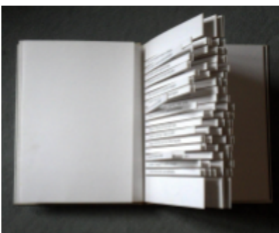
Queneau, R., 1961. Cent mille milliards de poèmes . Paris: Gallimard.