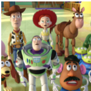
Toy Story . 1995. [film] Directed by J. Lasseter. Pixar Animation Studios.

Aslan is the King of Beasts in Narnia by C.W. Lewis. In "The Lion, the Witch and the Wardrobe" which is the first book and movie, Aslan, a talking lion, helps support four siblings who have come to save Narnia. Lewis revealed that Aslan represents Christ as he saves Edmund, one of the siblings, by sacrificing himself on an altar and later being resurrected.