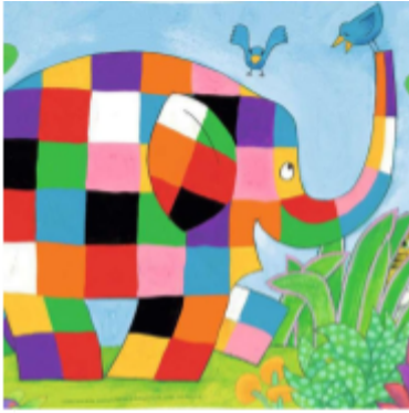
McKee, D., 1968. Elmer the Patchwork Elephant . Dobson Books.

Elmer is the only elephant that is covered in patchwork colours. Everyone knows him and everyone greets him when they see him. Elmer always makes everyone laugh and he brings them happiness. However Elmer would like to fit in and be like the other elephants. So one day he decides to paint himself grey. But he feels sad as everyone around him stays quiet. So he decides to embrace his difference and realizes there's no point in hiding his true self. Still a beautiful story about celebrating differences.