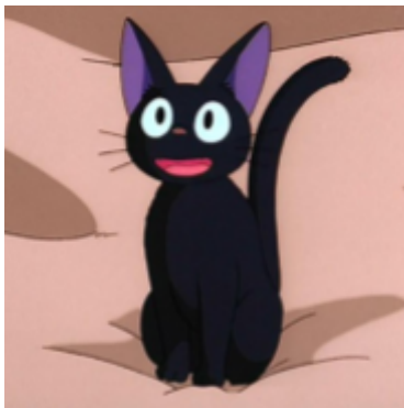
Kiki's Delivery Service. 1989. [film] Directed by H. Miyazaki. Studio Ghibli.

The aim is not to go into depth about each character so you can relate to them because I believe that can only be done by experiencing the format they were a part of. I merely want to show how children are exposed to anthropomorphized characters in books and TV to experience and learn something much like fables did.