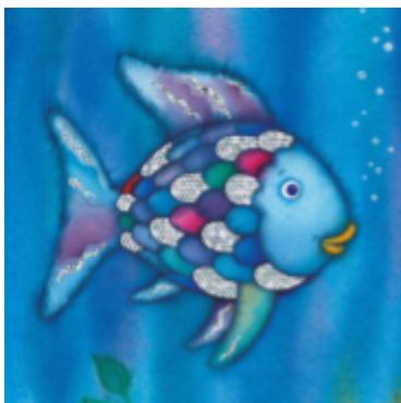
Pfister, M., 1992. The Rainbow Fish. NordSüd Verlag.

Jiji the cat in the Ghibli Studio movie "Kiki's delivery service" is Kiki's companion. Jiji is there for Kiki, always giving her advice and helping her out. However later in the movie as Jiji finds love and Kiki struggles to become a witch both characters stop understanding each other. Kiki can no longer hear Jiji talk as she becomes busy making her own life and decisions. Jiji helps portray the hardship of a child's transition into adulthood yet Jiji is just a cat.