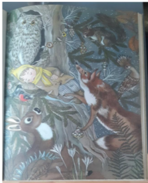
Perrault, C. and Illustration Clouzier, A., 1697. Contes de ma mère l'Oye . Paris.