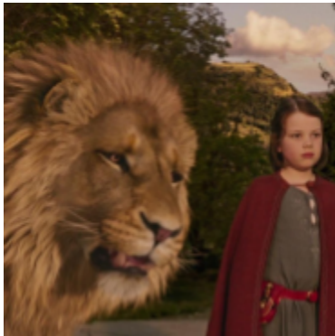
The Chronicles of Narnia: The Lion, the Witch and the Wardrobe . 2005. [film] Directed by A. Adamson.