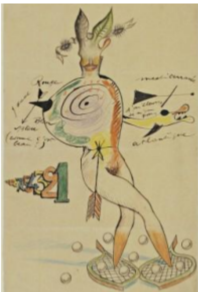
Tanguy, Y., Miró, J., Morise, M. and Ray, M., 1926. Cadavre Exquis . [Composite drawing of ink, pencil, and colored pencil on paper].

From the historical Surrealism art movement of the 20th century emerged methods such as surrealist automatism. The Surrealist movement was driven by the idea of breaking away from the rules of society and letting go of rational thinking. Whilst as the Glossary of Tate Museum (2022) states, automatism which comes from physiology, refers to “bodily movements that are not consciously controlled like breathing or sleepwalking”. This automatism notion was later used in psychology by Freud as part of a method to explore and trigger the unconscious mind through the form of automatic writing and drawing. (Tate Museum, 2022) Thus, surrealist automatism is an art method that triggers the unconscious mind to take over creative making. I aim to reflect this idea in the method I have created for my workshops.