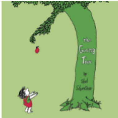
Silverstein, S., 1964. The Giving Tree . Harper & Row.

The Giving tree is about a Tree and his favourite boy. As the boy ages the tree tries to keep up and gives the boy everything he needs even if that means becoming nothing but a tree stump that the old boy can rest on.