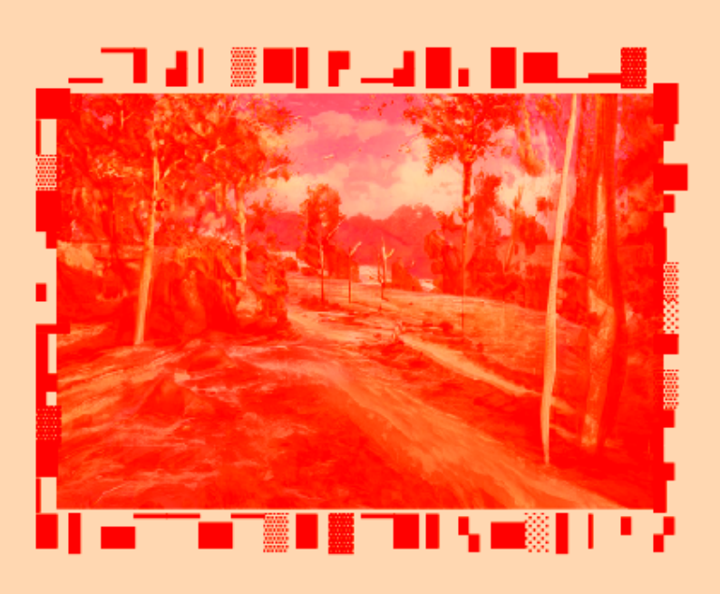
Pick up a limited printed copy at Page Not Found!