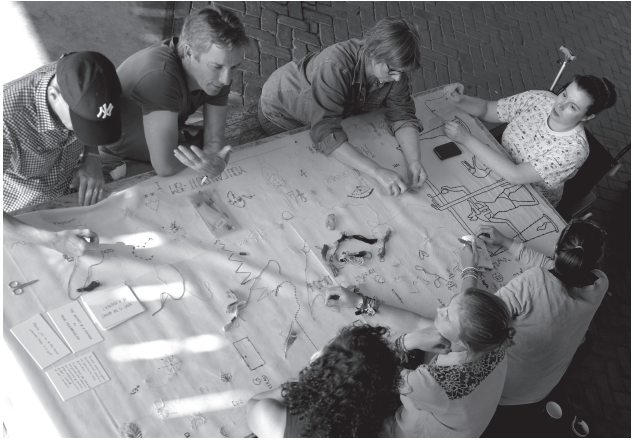
The Weight of a Feather (2018)