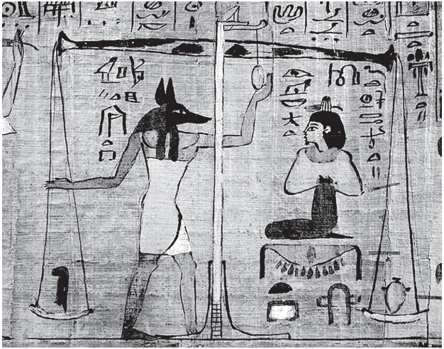
Weighing of the Heart, taken from Book of the Dead